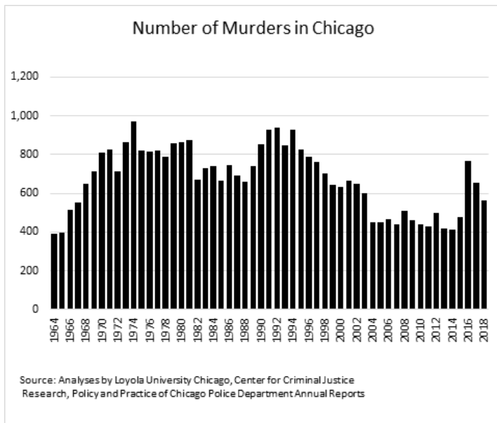
Figure 2: Yearly Murder Trend in Chicago, 1964-2018.

Young African American males (over 80% of victims/assailants) are statistically most at risk in this city. Murder is concentrated in districts that also suffer from intergenerational poverty, gang-infestation, social disorder, and economic blight. 46 However, murder is just one type of violence, albeit the most visible and fear inducing. This has broad implications for the negative reputations of several South and West side Chicago neighborhoods. (See Figure 3)